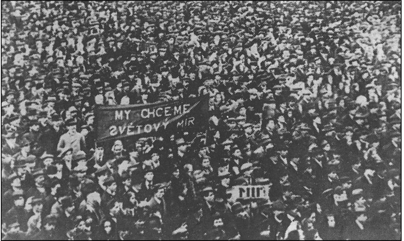
Workers' demonstration in Kladno during the social democratic general strike in October 1918. The banner is reading: "We want world peace."