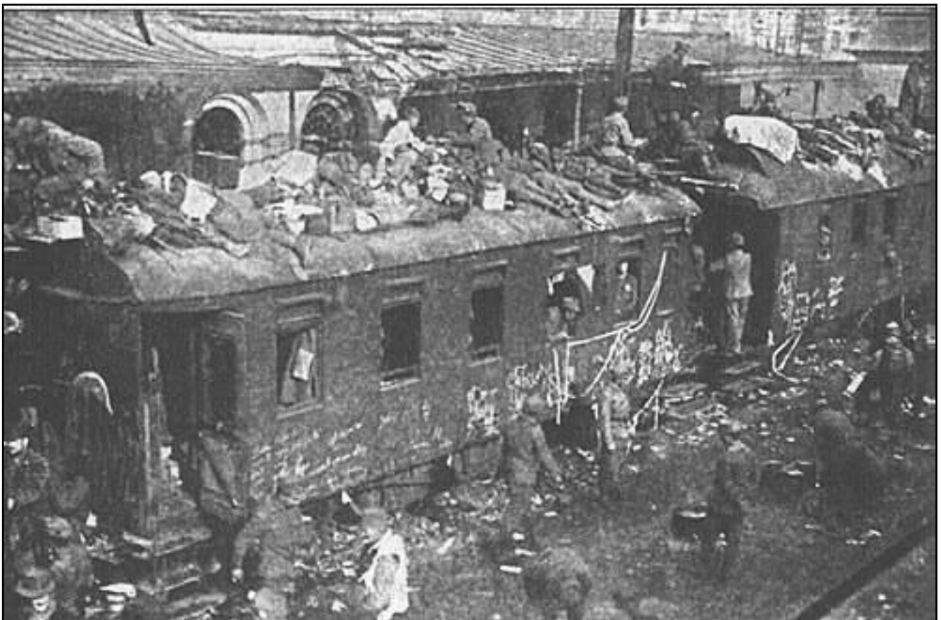
Austro-Hungarian soldiers massively deserting the Italian front in autumn 1918 while taking over whole trains