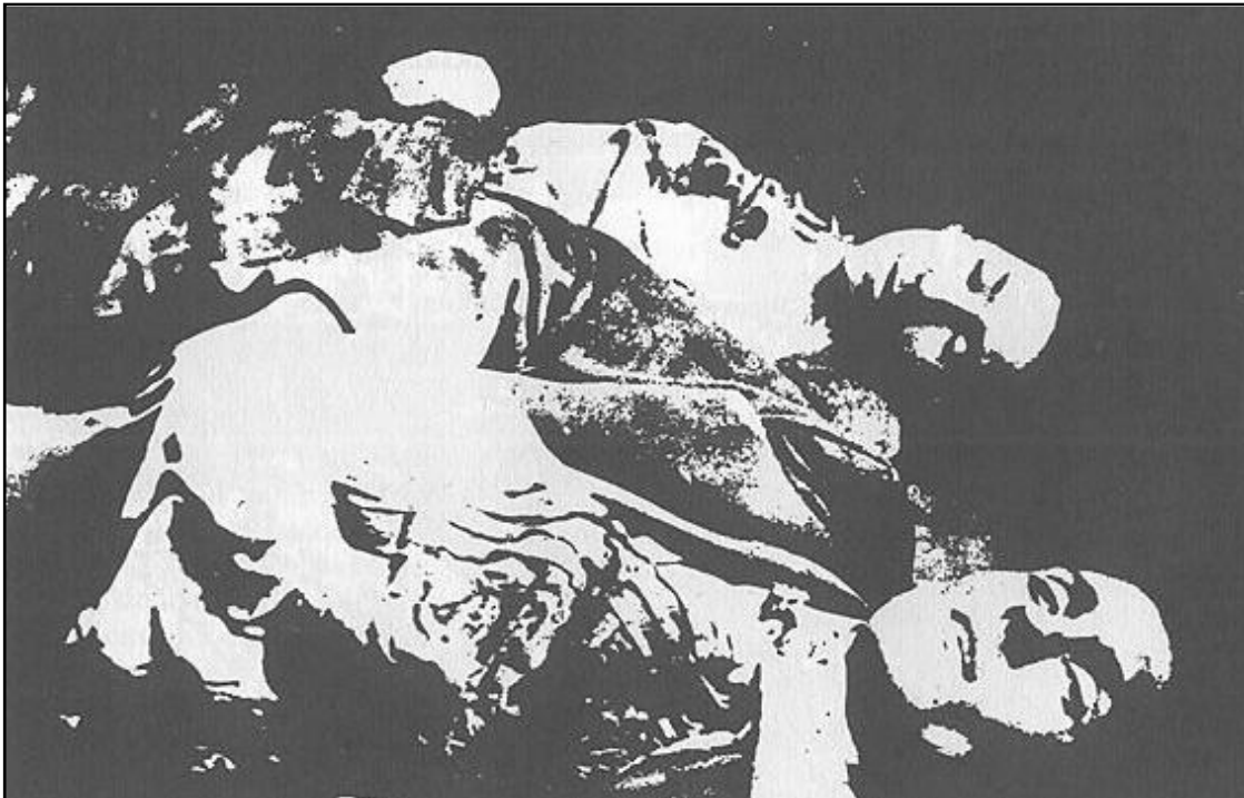
Workers shot dead during a riotous demonstration in Prostějov town