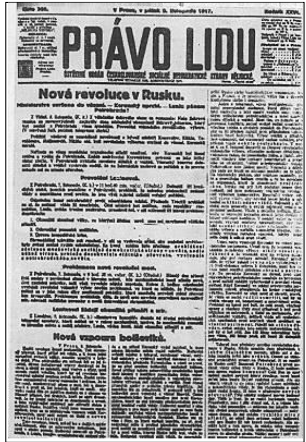
A copy of the social democratic paper „The People's Cause“ (Pravo lidu), which, as the first one in the Czech Lands, brought the news of the October insurrection in Russia