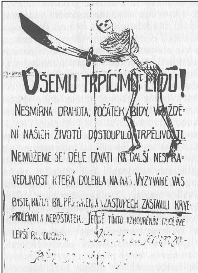
A workers' anti-war leaflet roughly from the end of 1917/ beginning of 1918. It's reading: "To all the suffering people! Extreme dearth, starting poverty, slaughter of our lives have broken the back of our patience. No more can we just watch injustice hitting us. We call on each of you to get ready and come in droves to stop the bloodshed and want. Only through such an uprising we can achieve better future. An injury to one is an injury to all."